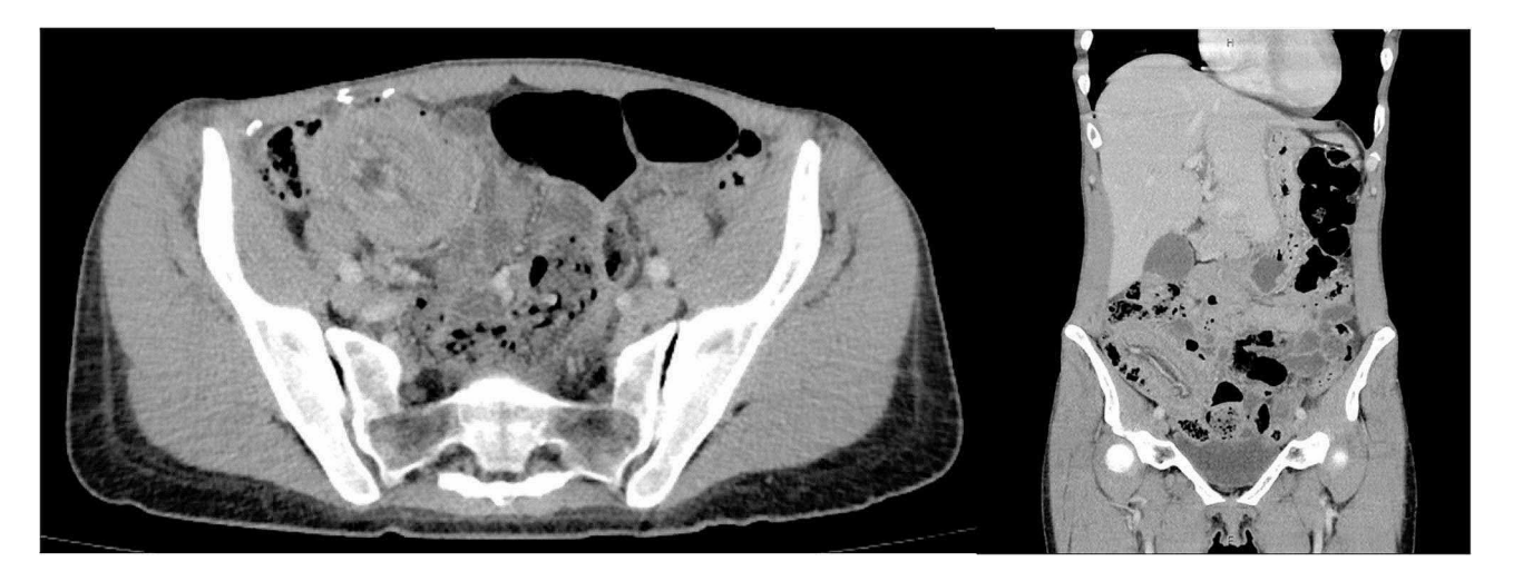
Fig. 1 CT abdomen pelvis (axial and coronal views) demonstrating lleocolic intussusception with mild dilatation of small bowel loops