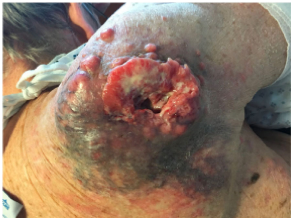
Fig. 4 Clinical image showing necrotic and fungating shoulder mass